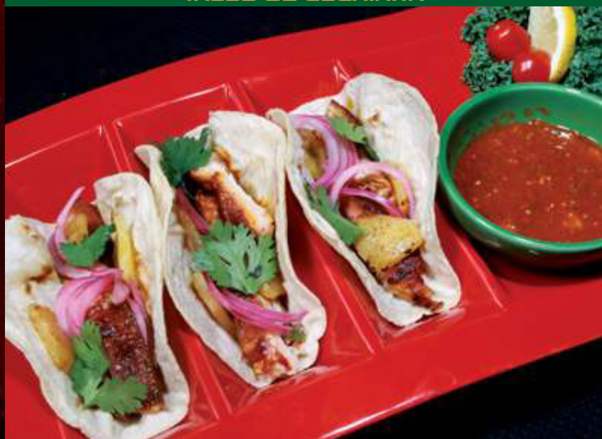
TACOS DE COCHINITA

(Pork) Three tacos filled with marinated pork belly slices cooked with pineapple. Topped with slices of marinated red onions, red cabbage, cilantro, and smoky red sauce on the side. Served with rice and beans 12.99